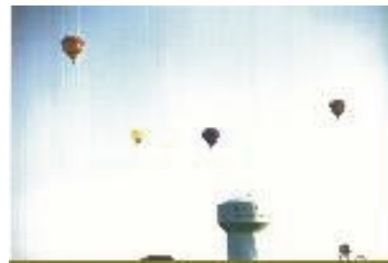
Approaching Task #1