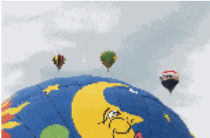
Saturday evening launch