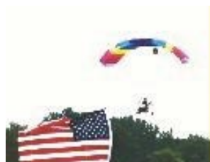
Saturday afternoon entertainment