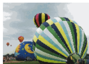
Saturday evening launch