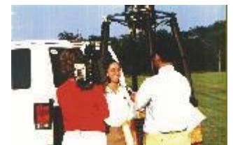
Channel 13 Interview