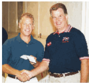
Congratulating the Flag City Champion.