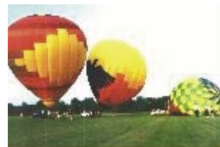
Thursday evening media flight