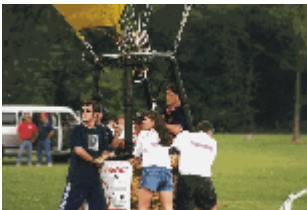
Ready to launch!