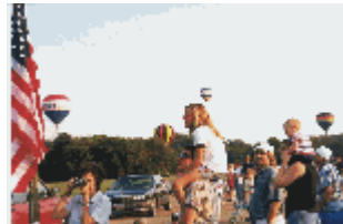
Friday evening flight