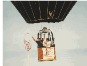
$1000 Pole Grab Winner