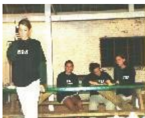
Proceeds benefited Project H.A.P.P.Y.