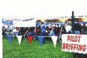
Pre-flight Briefing for Pilots & Crew Chiefs