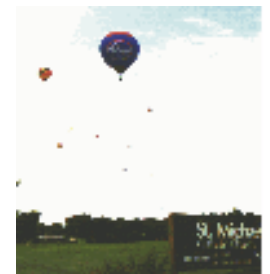
Approaching Task #2