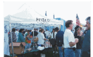
Ballooning - Hurry up & wait!