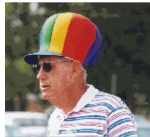
Local Balloon Enthusiasm