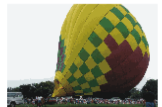
Saturday evening launch